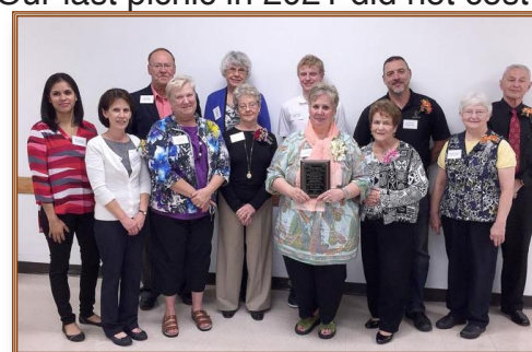
2016 Faribault, Unsung Hero