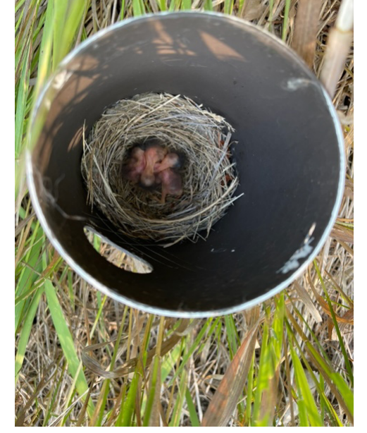
New hatchlings in the nest box this summer.

Out of the eleven nest boxes, four had tree swallows, two with chickadees, one with a wren and