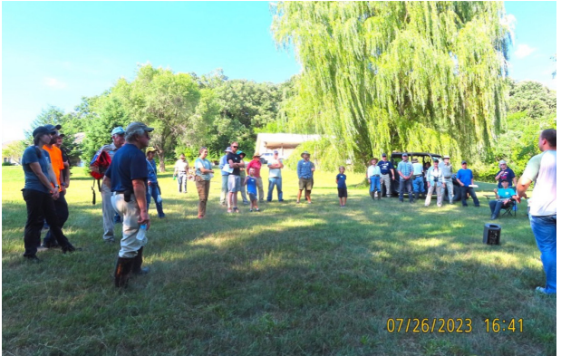
From next door neighbors to land owners from other counties, participants of all ages gathered for the 13th Annual Forestry Field Day

One gentleman, over 90 years old, added a warm and interesting idea