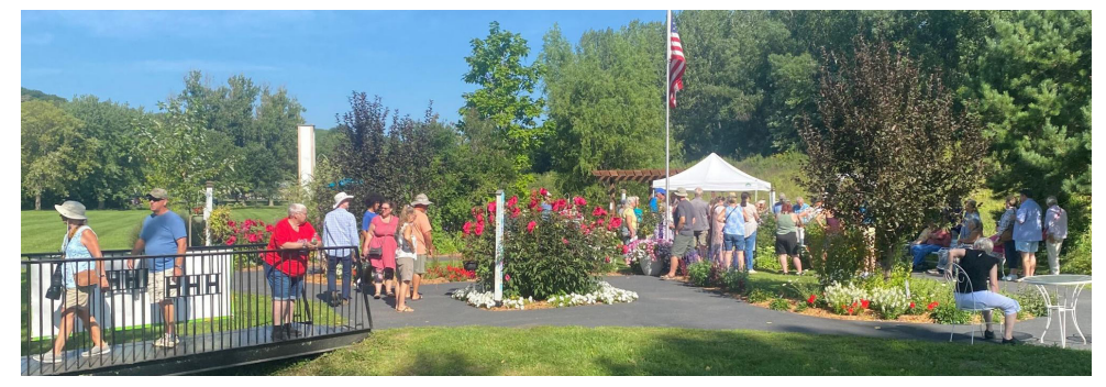
Hummingbird Garden in downtown Henderson, MN. This is managed by volunteers of the non-profit group Henderson Feathers.

Plans are moving forward for a National Ruby Throated Hummingbird Center in the western Sibley County community. There is a newly formed Hummingbird Trail Association and the soon-to-bebuilt 8-mile trail along the Scenic Byway (Sibley County Road 6) north of Henderson. The group were